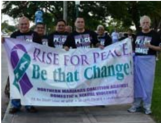
Day of Unity Men's Walk

The Day of Unity was scheduled on October 18, 2014 which included a whole day of entertainment and performances, a Men's Walk Against Domestic Violence, and a Candlelight Vigil at the Garapan Fishing Base. The last activity was held on October 31, 2014 where all Family Violence Task Force Agencies participated in Trunk or Treat and also had fliers and poster to further spread awareness of the effects of domestic violence.