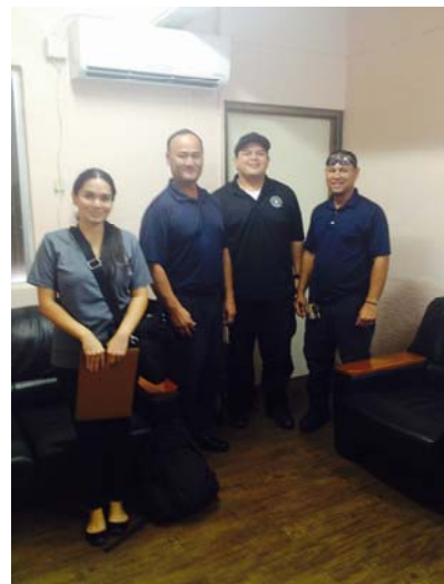
Tinian DPS site visit