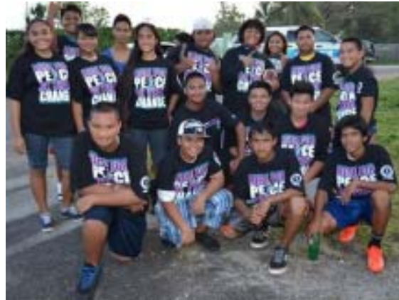
DVAM Village Walk