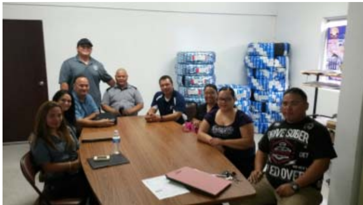
Rota DPS site visit

VAWA - CJPA conducted a site visit in Rota at the Department of Public Safety which is VAWA's only subgrantee. Rota expressed their need for office supplies and upgraded computer systems because most of their equipment were not working and out of date. Site Visits were also conducted in Tinian at the Department of public safety where they addressed the need for office supplies and repairs to current office equipment.