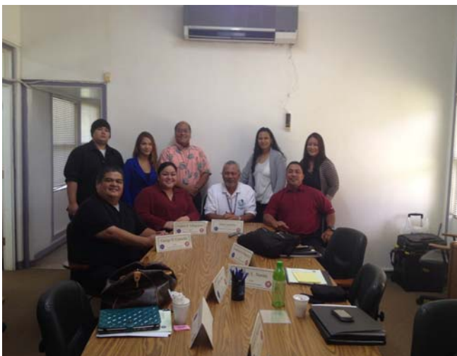
YAC Meeting at CJPA