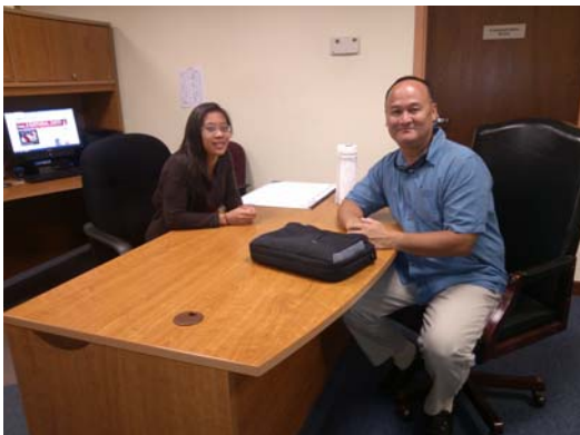
Rota Superior Court site visit