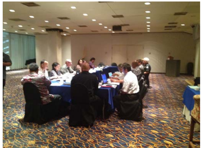
Supervisory Council Meeting at Aqua