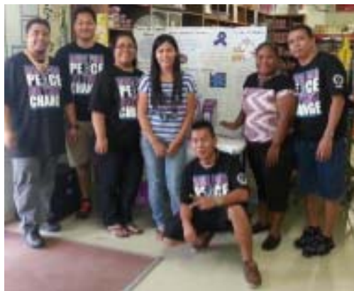
Celebrity Grocery Bagging